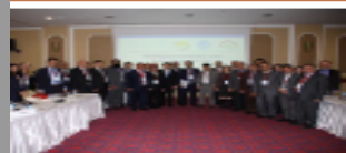
ECO-RCC Second Steering Committee meeting in Ankara, Turkey in February 2017

The Steering Committee which is composed of country representatives is the main decision body for the Centre.