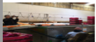
National Food Reference Laboratory, Beypazari, Turkey, February 2017

Food security is one of the major agenda items in the ECO region. ECO-RCC has a critical role in facilitating a regional approach to addressing the challenges of food security.*