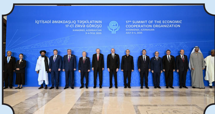
Azerbaijan Hosts 17th ECO Summit Khankendi – July 4, 2025