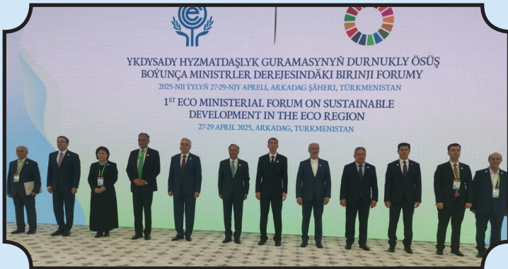
First ECO Forum on Sustainable Development