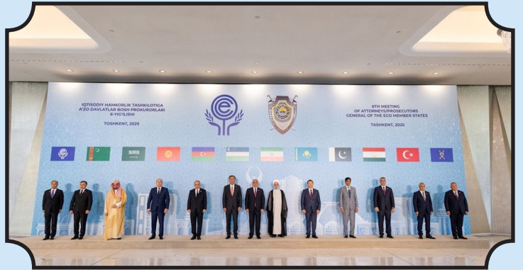
ECO Prosecutors/Attorneys General Meet in Tashkent – Sep 25, 2025