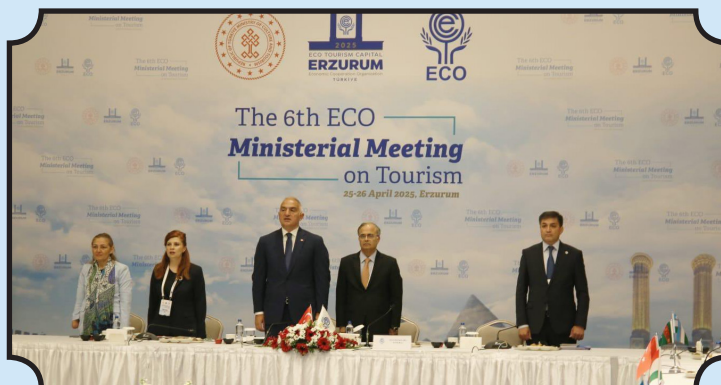
ECO Tourism Ministers Convene in Erzurum Erzurum – April 26, 2025