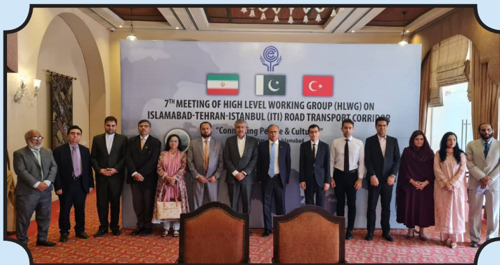
7 th Meeting of the High-Level Working Group on ITI Road Corridor held in Islamabad 09 September 2025 – Islamabad, Pakistan