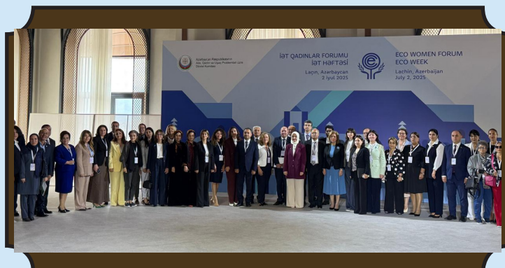
First ECO Women Forum convenes in Azerbaijan Lachin – July 02, 2025