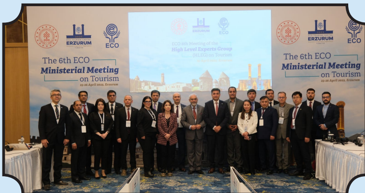
Erzurum Hosts 8 th Meeting of the High-Level Experts Group on Tourism Erzurum – April 25, 2025