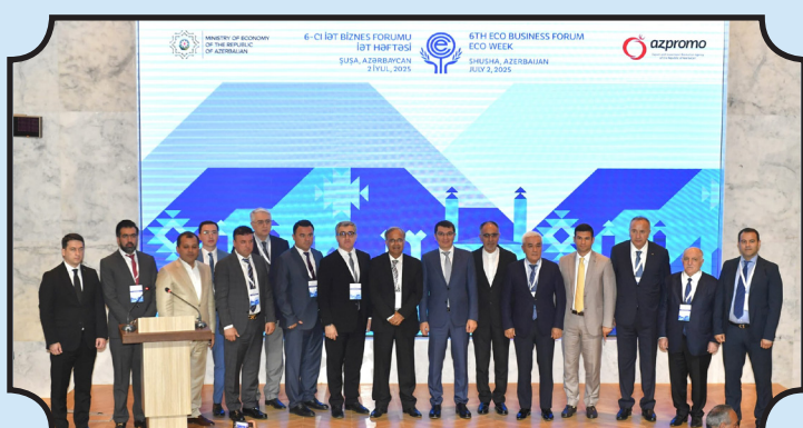
ECO Holds 6th ECO Business Forum Shusha – July 2, 2025