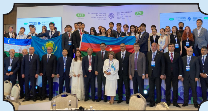
Azerbaijan Hosts First ECO Youth Forum Adgham – July 01, 2025