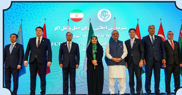
Tehran Hosts 13th Ministerial Meeting on Transport to Boost Regional Connectivity and Cooperation Tehran, 2 June 2025