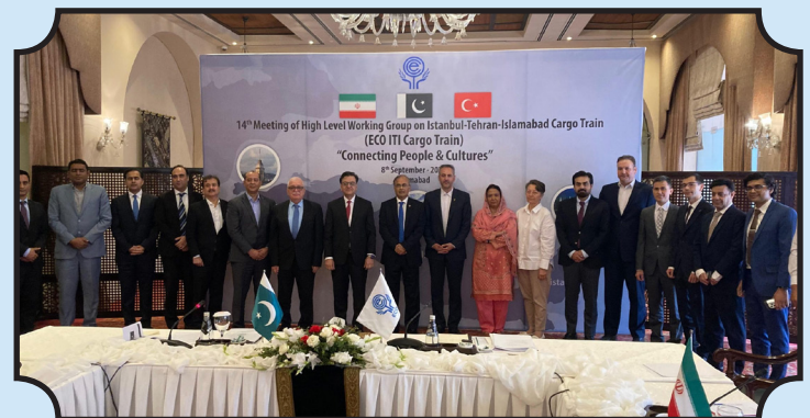
Pakistan hosts the 14 th Meeting of the High-Level Working Group on ITI Train Corridor 8 September 2025 – Islamabad, Pakistan