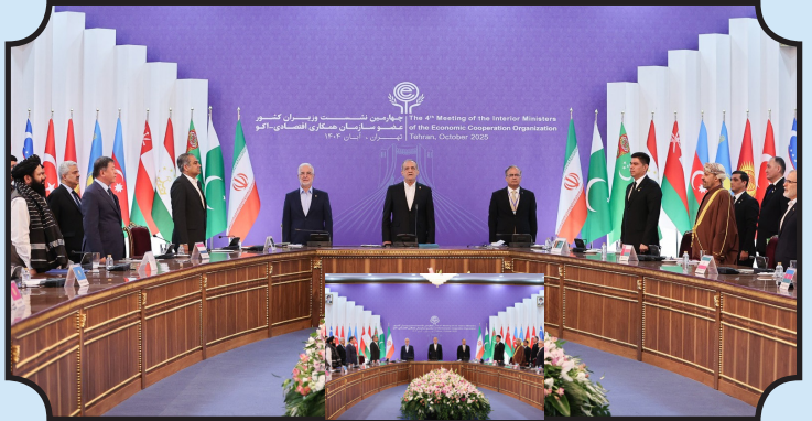
ECO Interior Ministers Meet in Tehran Tehran – October 28, 2025