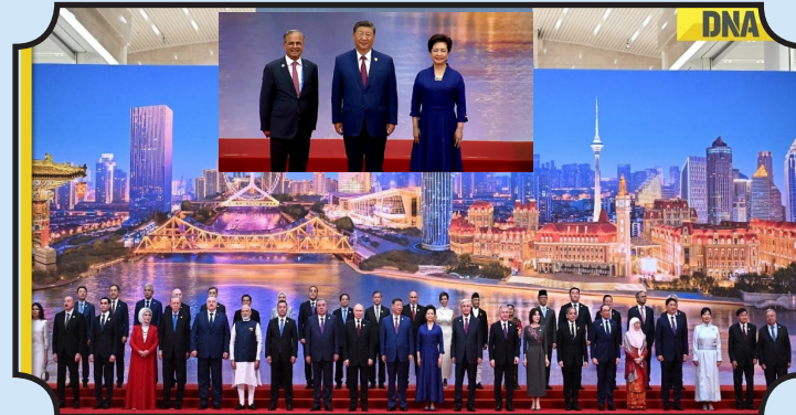
Secretary General Attends SCO Plus Summit in Tianjin September 1, 2025 – Tianjin, China