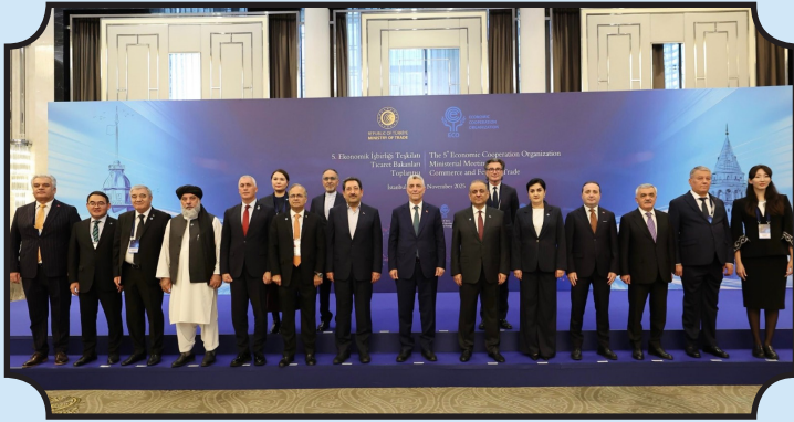
The 5 th ECO Ministerial Meeting on Commerce and Foreign Trade Istanbul – November 26, 2025