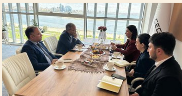
Baku, Azerbaijan – April 26, 2026